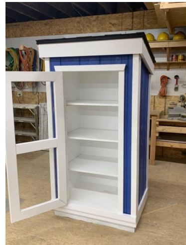
Live Healthy Appalachia using recovery funds to feed community members The Project REBUILD community blessing box