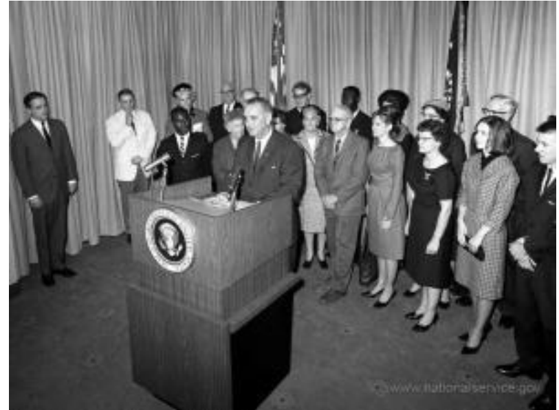
President Lyndon B. Johnson and VISTA volunteers.