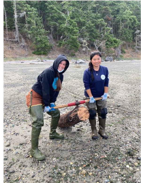
Earth Corps members removing creosote logs on Samish lands.